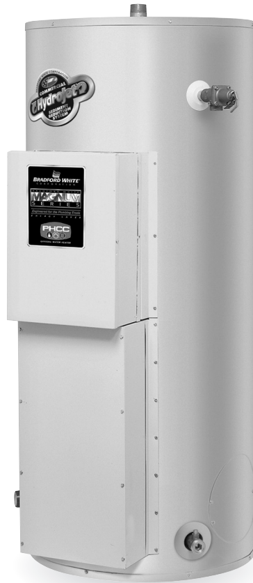
Photo is of M-II-50-kW-3SF