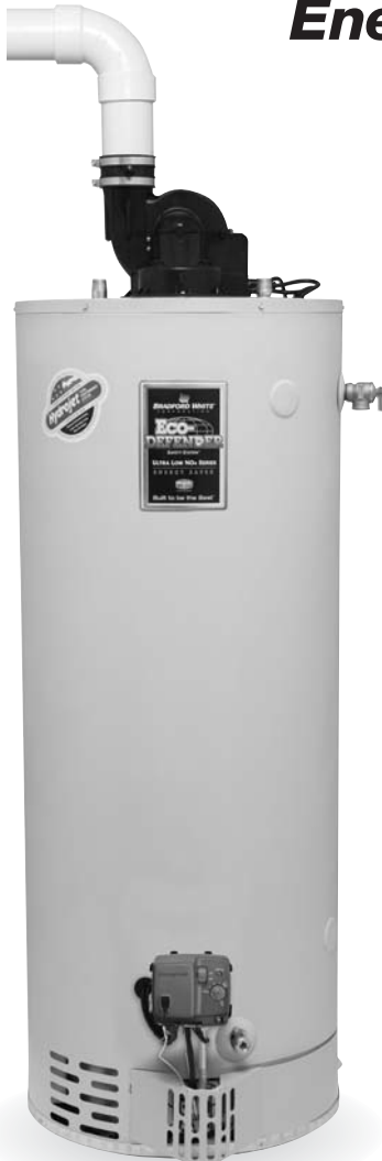
Photo is of U-TW4-50S-60FR-3N

Identical Dimensions Same diameter, height and connections as standard units for ease of installation.